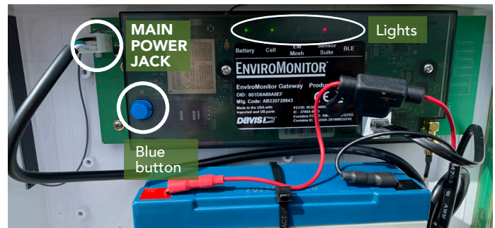
Figure 2: Inside of Gateway